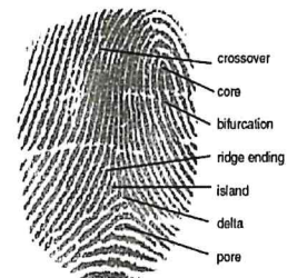
Make up of a fingerprint

Biometrics authentication is the automatic recognition of a living being using suitable body characteristics. By measuring an individual's physical features in an authentication inquiry and comparing this data with stored biometric reference data, the identity of a specific user is determined. There are many different biometric features that can be used for authentication purposes these include fingerprint, signature, iris, retina, DNA or any other unique characteristic. Once a characteristic has been chosen the next stage in the Biometric process is authentication. A biometric feature is saved on to a database. Once the data has been stored, a new scanning of the biometric feature is taken. If the comparison is positive, access to the appropriate application is granted.